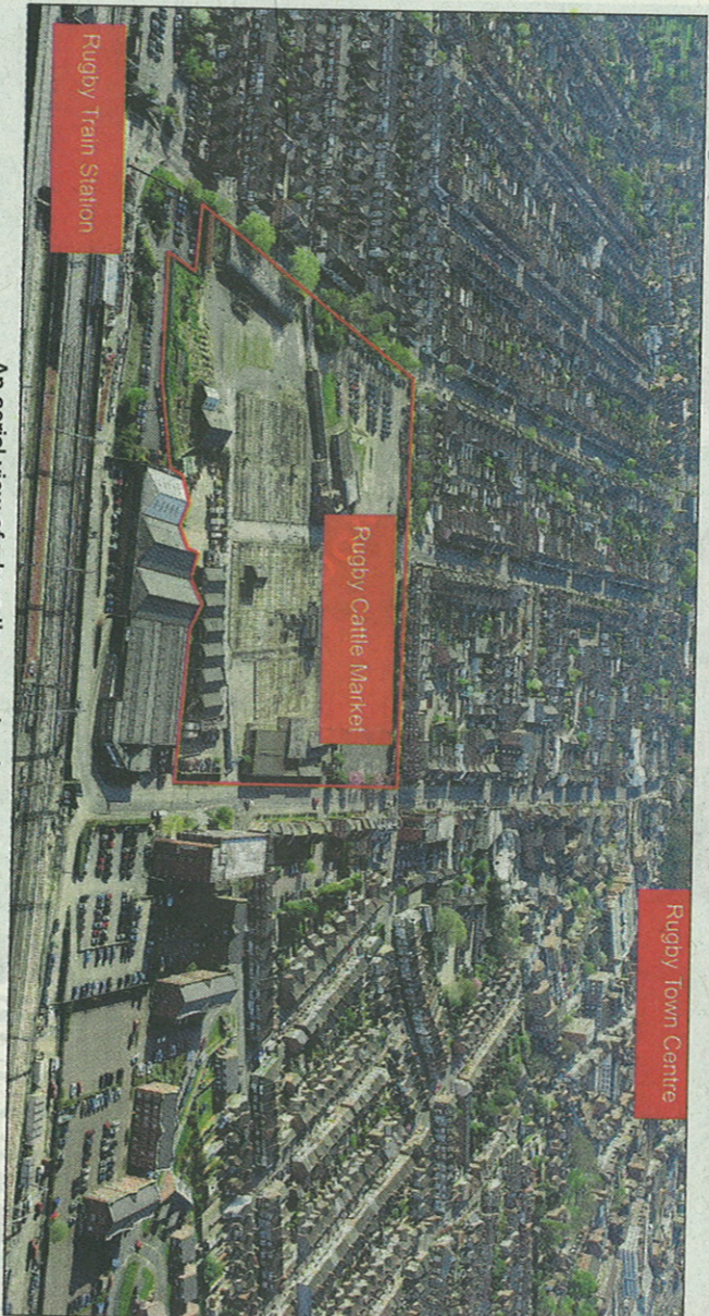
An aerial view of where the new development would be.